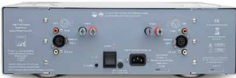
ABOVE: Single-ended (RCA) and balanced (XLR) inputs are joined by single-ended loop-through outputs and a single set of unswitched 4mm speaker binding posts

the amp simply presented the track in a way that really made me want to sit and listen intently.